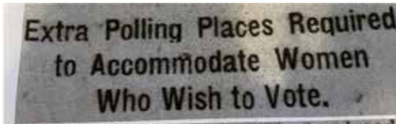
Sacramento Daily Union, November 16, 1911

That headline relates to a 1910 ballot measure to pay Mountain View Trustees $5 a month for their service. The measure was defeated by a tie vote of 101 to 101, a reminder that every vote counts.